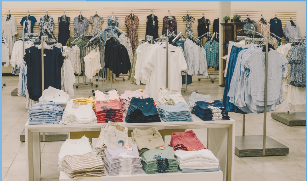
The CareLoft, Atlanta's Hidden Treasure